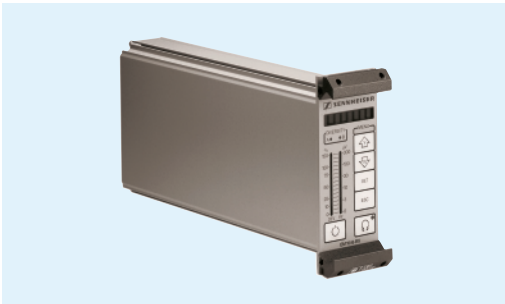
EM 1046-RX Receiver module

The EM 1046-RX receiver module is available in five frequency ranges between 138 MHz and 960 MHz. The frequency range within which receiver modules can be combined in one mainframe is limited by the RF input module in the EM 1046 MF. Receiving frequencies of a mainframe can be within the bandwidth of 24 MHz at UHF frequencies (7 MHz in the VHF band). In the EM 203 MF, the selective antenna booster limits the bandwidth of the receiving frequencies. The receiving frequencies are set at different levels: